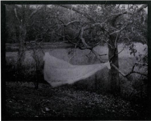
Philip Greene, Sheet in Wind , 2021, printed on Hahnemühle Fine Art Matte Rag 13 x 19 inches, limited edition print of 30

From an archeological and historical point of view, The Tashmoo Pumping Station, offers us a particular perspective, the proportions and interior volumes of this